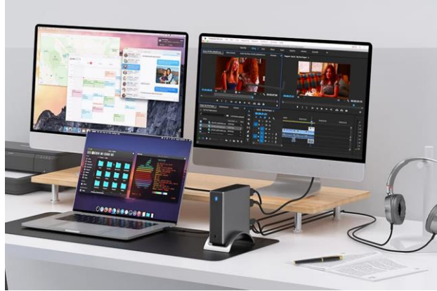
Figure 3.2 Extend Display Mode

In addition, the software also supports the rotation function, the user can simply set the "Settings -> Display" if the display setting support rotation. This feature is very useful for portrait display or special scenes, to bring users more choices and personalized experience.